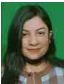
Divya B.Voc (ENT) Sem-III&IV