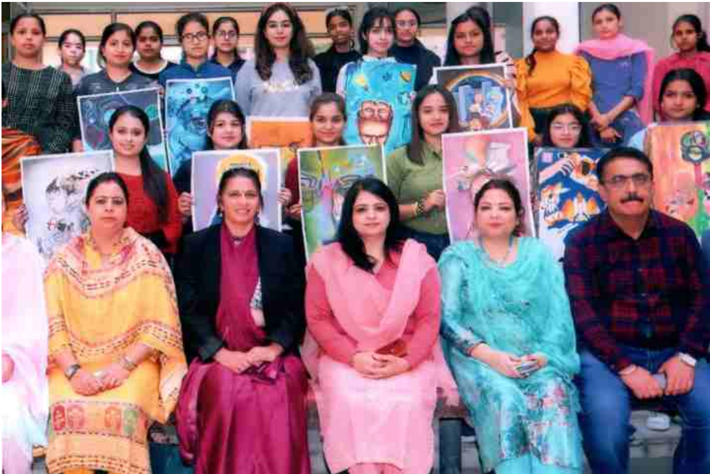
Students showcasing their paintings created for the Y-20 Summit