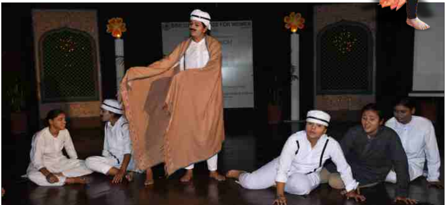
Play 'Ek Saccha Desh Bhagat' being staged to commemorate the birth anniversary of martyr Bhagat Singh