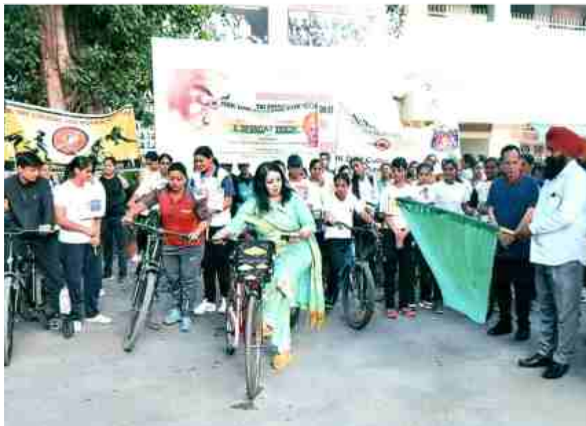
A cycle rally being flagged off to mark the 115th birth anniversary of Martyr Bhagat Singh