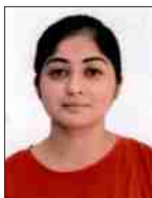
Praisy B.Voc (Fashion Tech) Sem-II