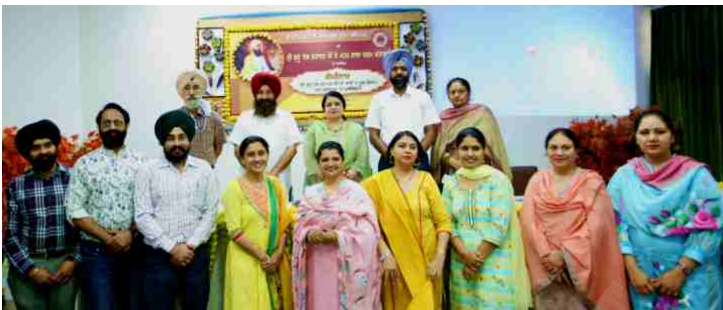
A seminar being organised to mark the 400 th Birth Anniversary of Shri Guru Tegh Bahadur Ji