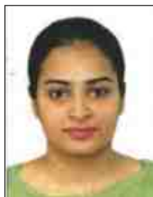
Kangan B.Voc (RM) Sem-III & IV