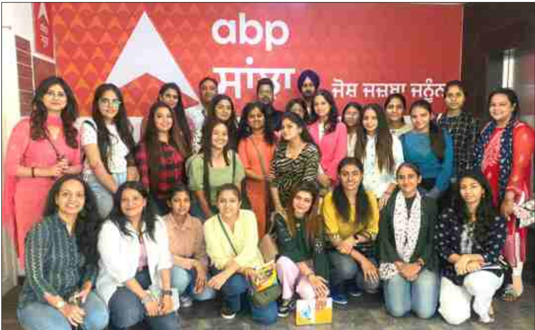
Students of the PG Department of Journalism and Mass Communication visiting ABP Sanjha, Mohali, during the educational trip

Semester-IV International Communication Human Rights Film Studies Inter-cultural Communication Dissertation