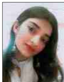
Palvi B.Voc (B&F) Sem-V&VI