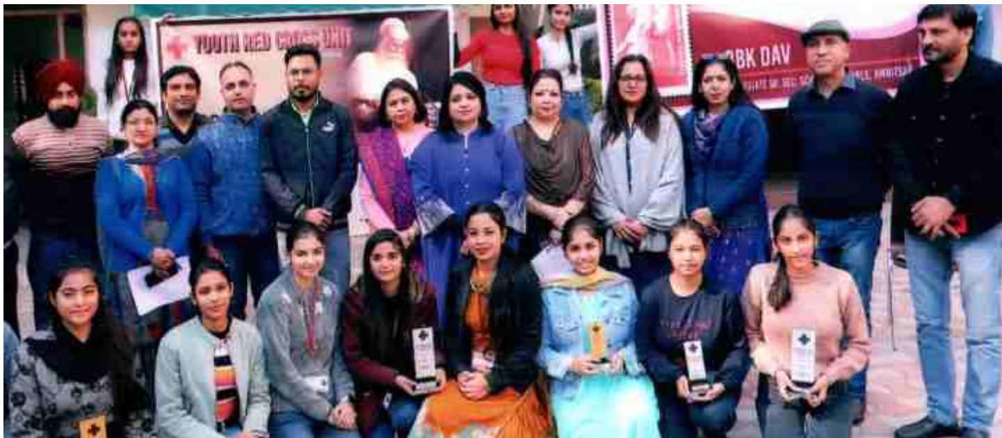
Students of the Red Cross Unit of the college winning laurels in the State level Red Cross Competition