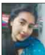
Yashika B.Design. Apollo Digitext