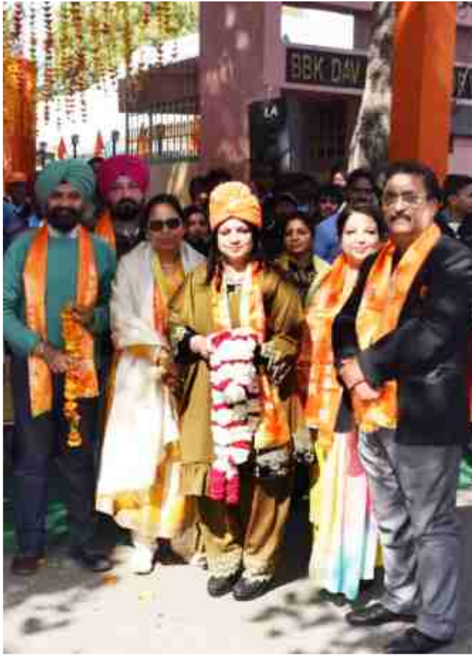
Maharishi Swami Dayanand's 200th Birth Anniversary and Bodh Utsav being celebrated on the college campus