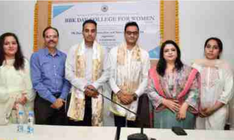
Seminar on 'Scope of Punjabi Journalism in Transnational Media' being organised by the PG Department of Journalism and Mass Communication