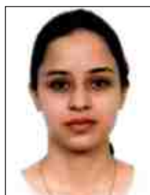
Rabaab Kaur Interior Design BD Sem-I