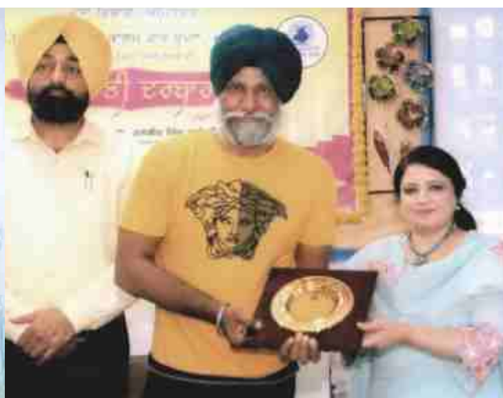
Kahani Darbar being organised by the PG Department of Punjabi