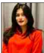
Muskaan BCA WIPRO