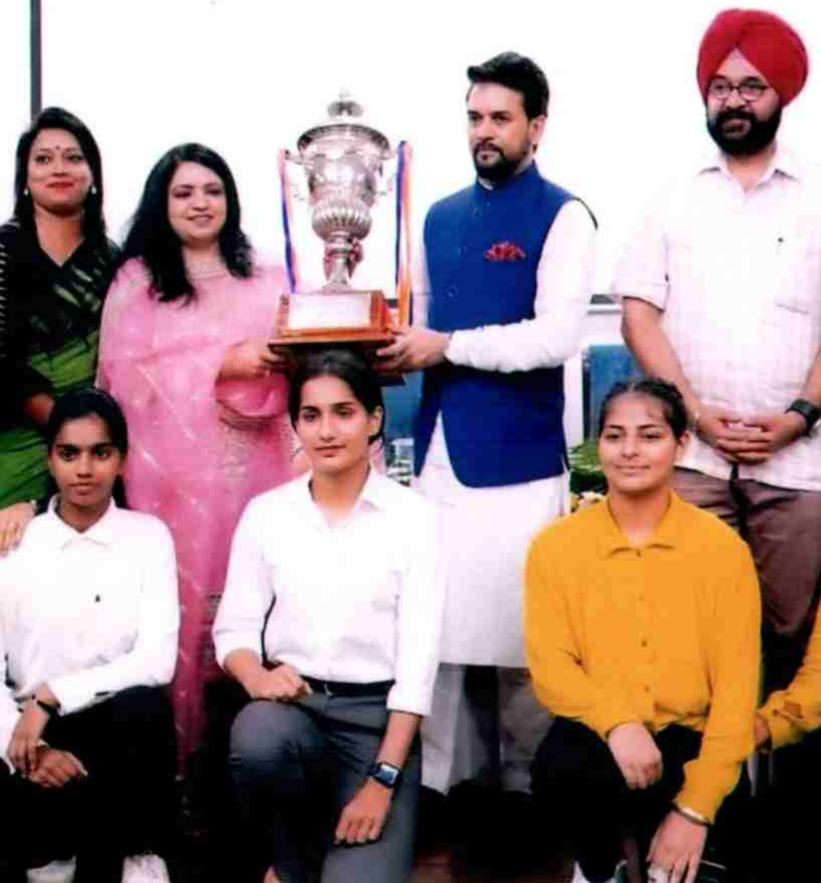
BBK DAV lifts the Overall GNDU General Sports Championship Trophy (Women) 2021-22