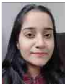
Dishka B.Voc ENT Sem-III