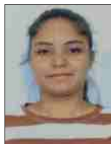
Gunjan B.Voc (ENT) Sem-I