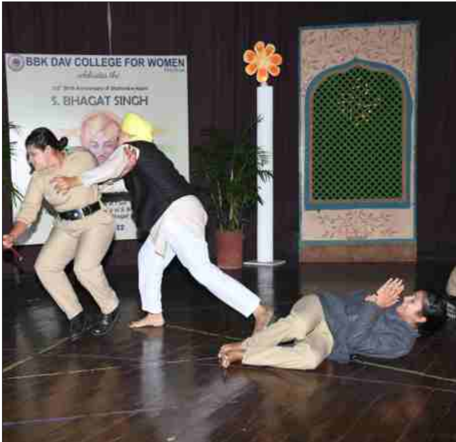
Play 'Ek Saccha Desh Bhagat' being staged to commemorate the birth anniversary of martyr Bhagat Singh

Entertainment industry is growing at a very rapid pace and there is a huge demand supply gap of technical personnel not only at the regional level but also at the national level. Qualified graduates will be able to provide the expertise and professionalism required for this industry. Professionals trained in new technology will be absorbed in industry as technology is growing at a fast pace and there is acute shortage of trained professionals in new technology. The college has a great potential in respect of talented faculty, students and infrastructure in the said field.