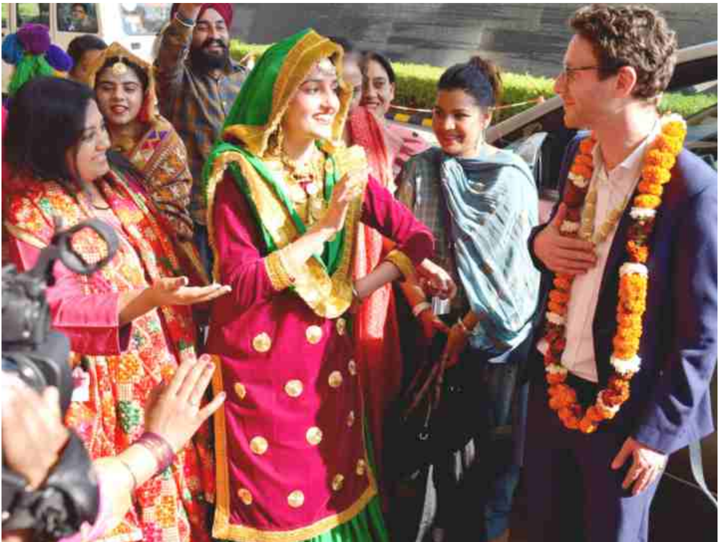
G20 delegates being welcomed by the BBK DAV Gidha team at Radisson Hotel, Amritsar