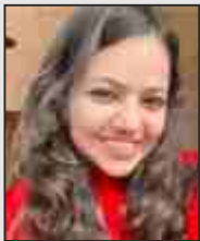
Avni MA JMC PUNJAB FEVER 104 FM