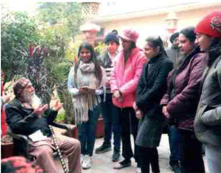
NSS volunteers interacting with inmates of an Old Age Home