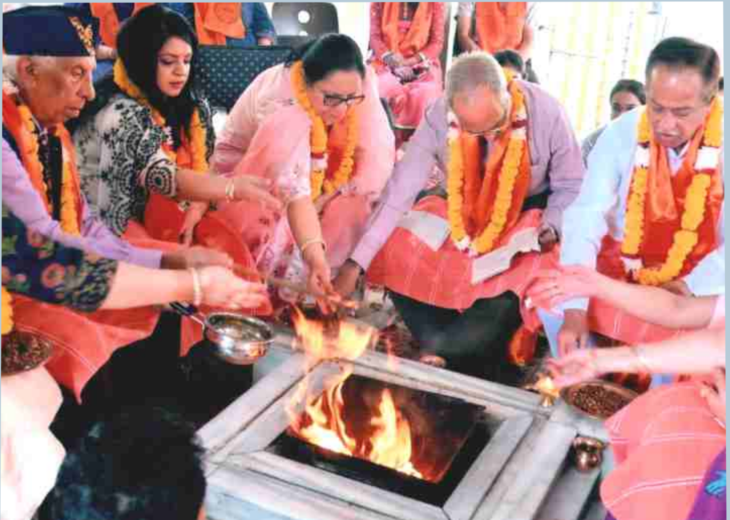
Havan Yajna being performed to commemorate the birth anniversary of Mahatma Anand Swami Ji