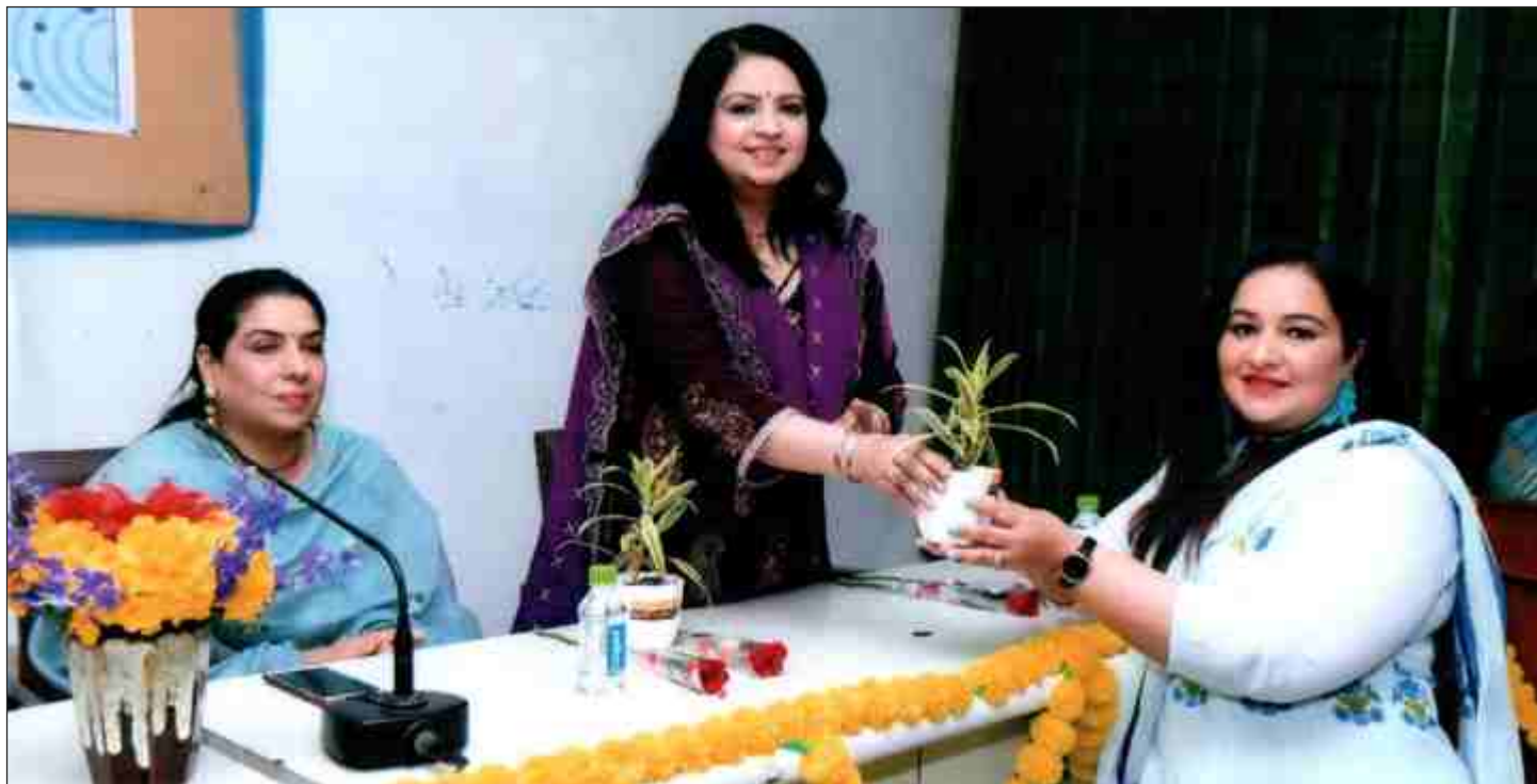
Cyber Jagrookta Diwas being observed on the college campus