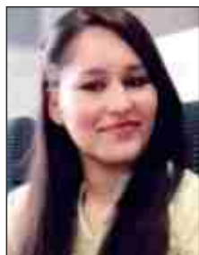
Kritika MTM Sem-IV