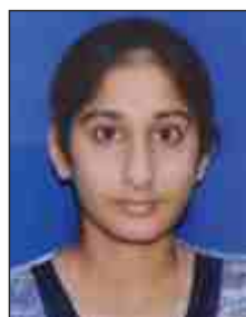
Neha B.Voc (ENT) Sem-II