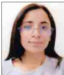
Janatpreet BD Sem-I