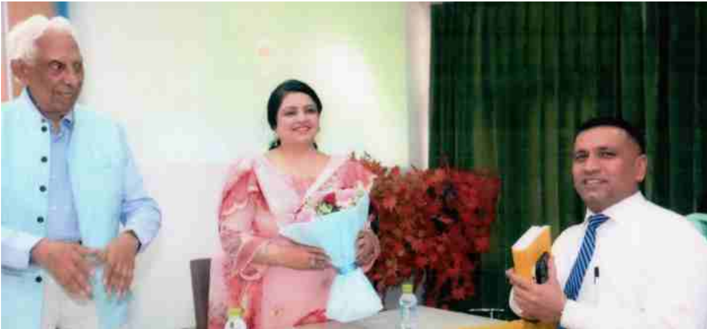
World Poetry Day being celebrated on the college campus

NOTE: Hostel dues, once paid, WILL NOT be refunded under any circumstances. No applications for refund will be entertained in this regard.