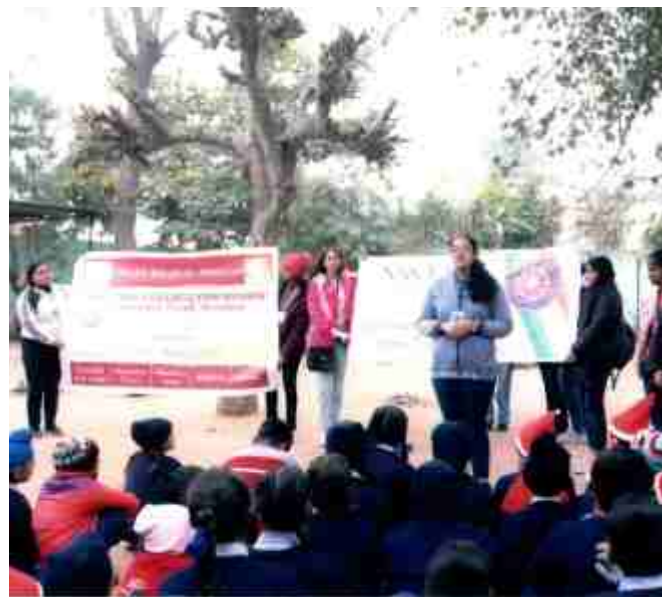
NSS volunteers educating students of the Elementary School of the adopted village Malawali about the importance of cleanliness