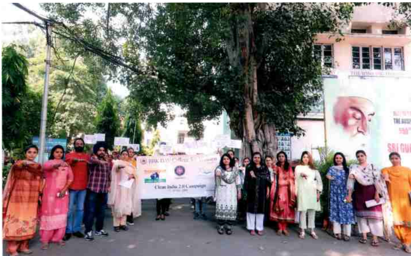
Oath being taken by NSS volunteers as a part of the Clean India 2.0 Programme and Fit India Run 3.0 Programme