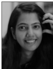
Charu MDM Sem-III & IV