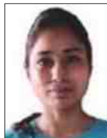
Roshni B.Voc (Retail) Sem-V