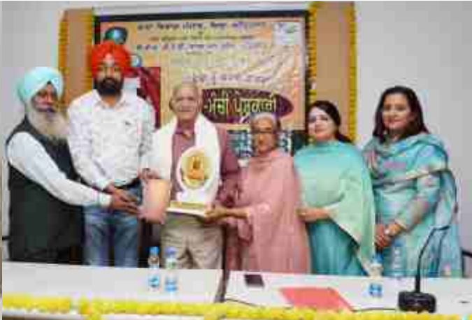
World Theatre Day being celebrated on the college campus