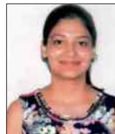
Sakshi MTM Sem-II