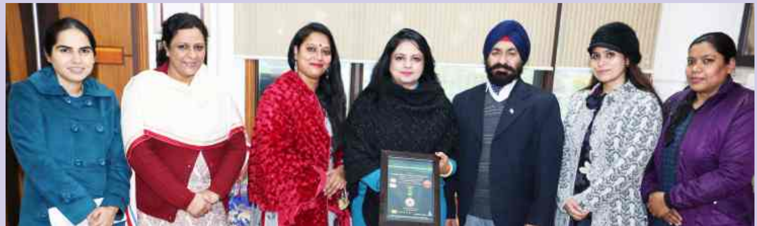
College was awarded the Best Institution Award-2020, as part of the International Educational Institution Awards 2020, organized by Patanjali College of Yoga & Research Centre, recognized by Yoga Alliance International and affiliated to International Yoga Federation.