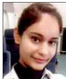
Harmeet MTM Sem-II