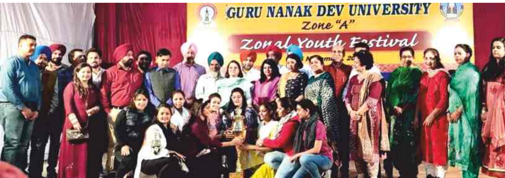
BBK DAVians in a jubilant mood on recreating history by lifting Overall Championship Trophy in Zonal Youth Festival of GNDU.

The college, continuing its winning streak, won Overall Championship trophy in Zonal Youth Festival of GNDU, held at Shaheed Darshan Singh Pheruman Memorial College for Women, Rayya, from November 3-6, 2019. The College won the championship trophy by attaining 149 marks and securing 29 positions in 34 events. The college participants made their mark by winning 1st position in 21 events, namely Group Bhajan/Shabad, Mime, Folk Orchestra, Skit, One Act Play, Classical Instrumental Non-Percussion, Group Song, Vaar Singing, Kawishri, Rangoli, Classical Dance, Folk Song, Phulkari, General Dance, Elocution, On the Spot Painting, Cartooning, Geet/Gazal, Western Group Song, Western Vocal Solo and Classical Vocal, 2nd positions in 5 items namely, Quiz, Poetical Symposium, Classical Instrumental Percussion, Costume Parade and Collage and 3rd position in 3 items namely Giddha, Installation and Clay Modeling. It is pertinent to note that this year college has won this trophy with a huge margin of 59 points.