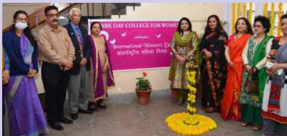
PG Department of Applied Art, Fine Arts and Design organized Painting Exhibition and Recitation Competition to mark the celebrations of International Women's Day on March 8, 2021.