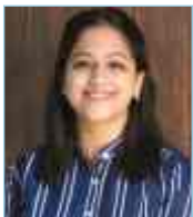
Taruna, BCA WIPRO, SBI LIFE, INFOSYS