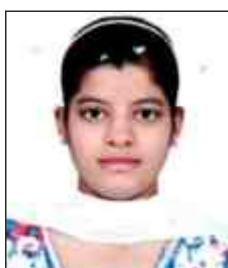
Navjot B.Voc Fashion Tech Sem-IV