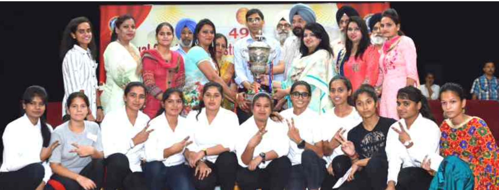
BBK lifts overall GNDU General (Women) Sports Championship Trophy (2018-19). Our players won a huge amount of Rs.17,00,000 on the 49 th Annual Sports Prize Distribution Function of Guru Nanak Dev University, Amritsar.

The college bagged the GNDU Overall General Sports Championship Trophy (Women) 2019-20 and also won second runners-up Shaheed-e-Azam Bhagat Singh Overall General (Men & Women Combined) Sports Championship 2019-20. The college sportswomen were awarded total cash prizes of Rs.12,00,000 (Rupees Twelve Lakh only) for their commendable achievements in various sports events. It is worth mentioning that BBK DAV College for Women is the only college amongst the women colleges under GNDU to win the championship.