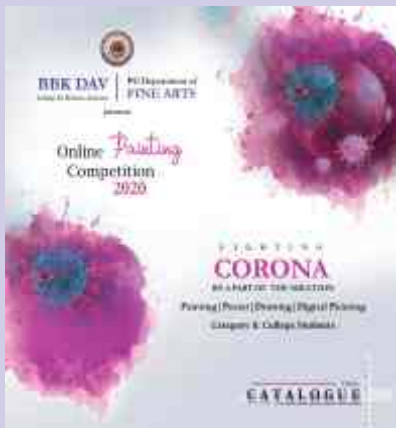
PG Department of Fine Arts organized an Online Painting Competition on 'Fighting Corona - Be a Part of the Solution' in which various events were held such as competition in painting, poster-making, drawing and digital painting. A digital catalogue was prepared and exhibited on the college Facebook page.