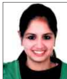
Aarzoo MTM Sem-IV