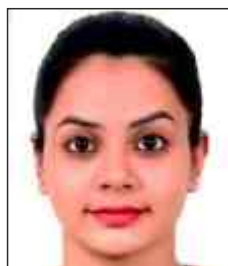
Muskan B.Voc (Theater & Stage Craft) Sem-VI