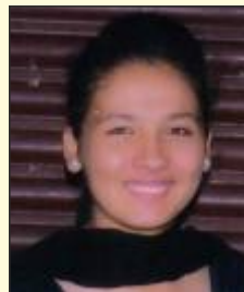
Suneha B.Voc (Ent Tech)-IV