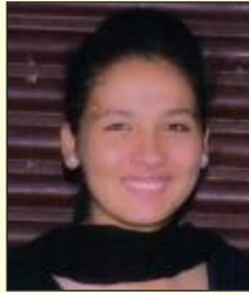
Suneha B.Voc (Ent. Tech)-III