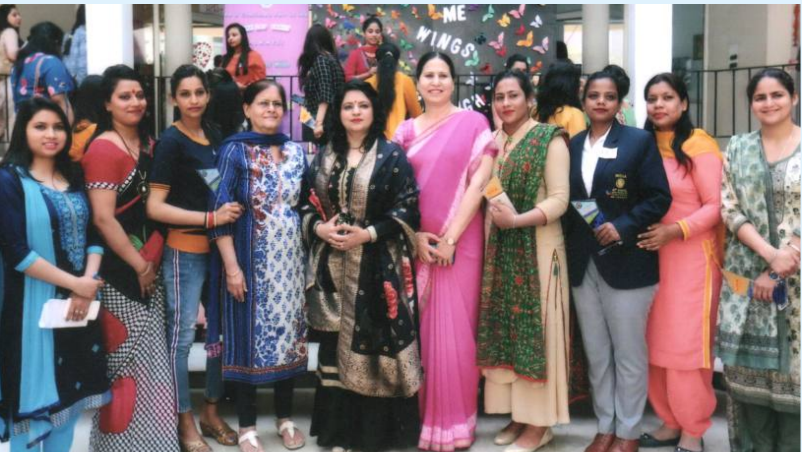
Notable Alumni of the college receive special awards at Alumni Meet - 2019